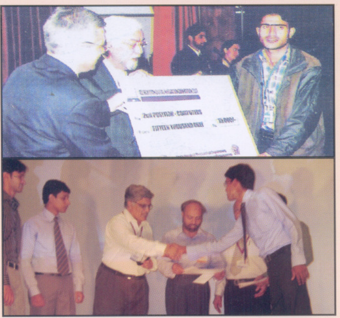
Students from Mechanical Engineering Department, MUET, Jamshoro receiving awards in 2007 and 2008 DICEs.

To expedite the process of Digital Revolution in Pakistan by motivating both academia and industry to acquire, promote and utilize state-of-art digital technologies/high-tech software for the rapid development of innovative products.