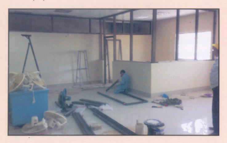
Rehabilitation is on full swing in Mechanical Engineering Department

Rehabilitation of Mechanical Engineering Department started in the month of September 2009 is in progress in order to strengthen the department by establishing new laboratories and extending existing facilities. The department plans to construct sixteen new fully equipped laboratories by placing new state-of-the art equipments.