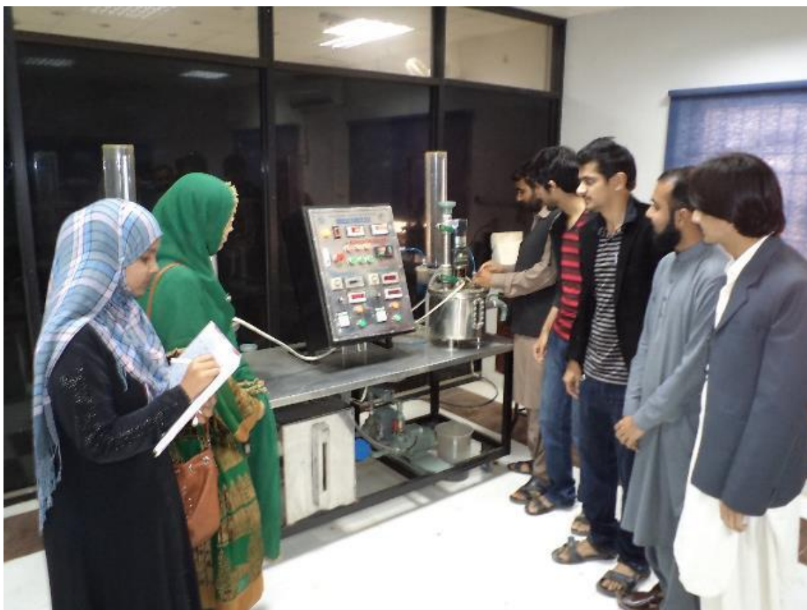
Solid Waste LAB