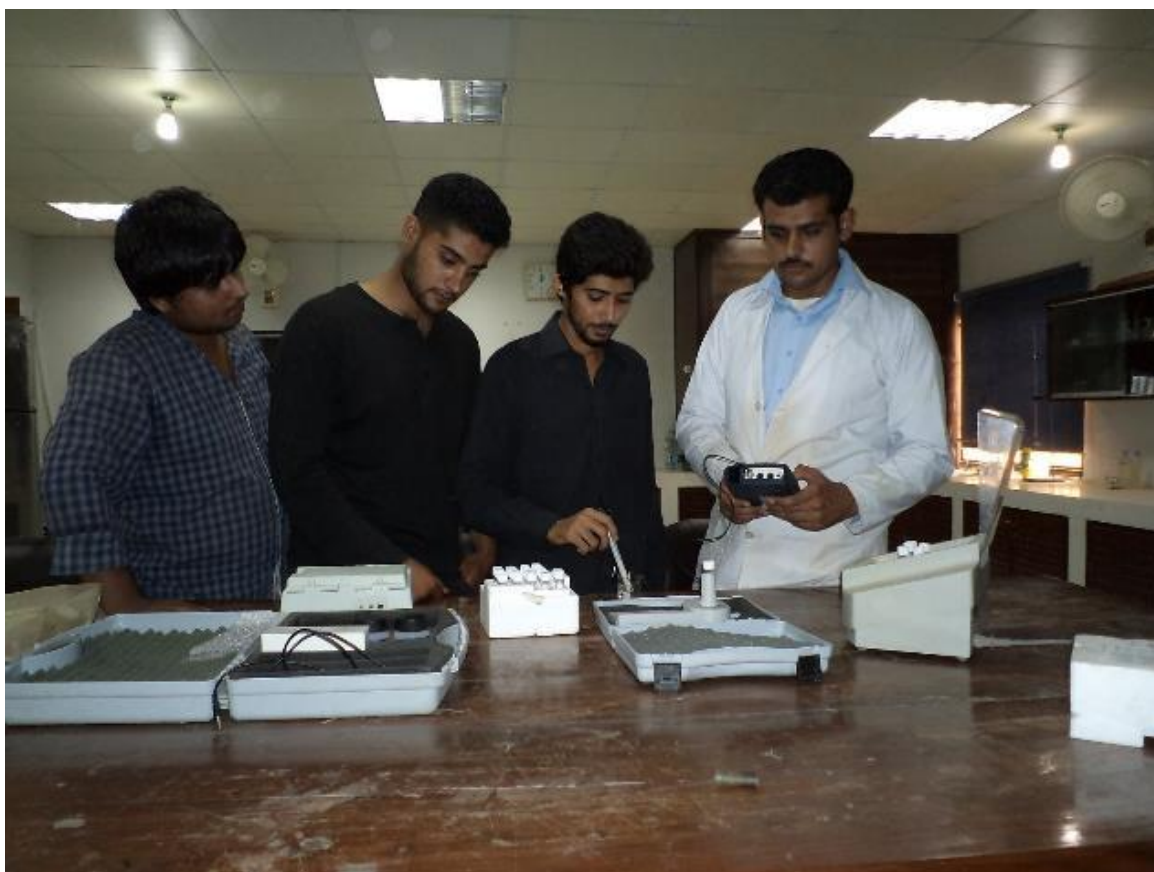
Soil & Water Testing LAB