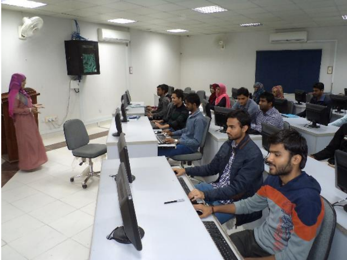
GIS & Computer Lab

The Institute also has seminar library available in its premises, which provides the option of latest Publications of books, Journals, Research reports in the field of Environmental Engineering.