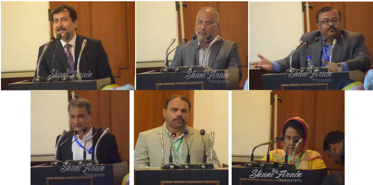
Respected Guests Expressing their feelings about Workshop.