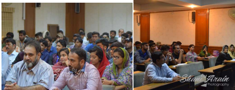
Participants during Inaugural Ceremony