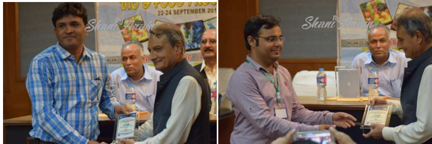
Exchange of Shields, Worthy Vice Chancellor Presented Shield to the Chief Guest and Guest of Honor and the worthy Chairman Presented Shield to Vice Chancellor.